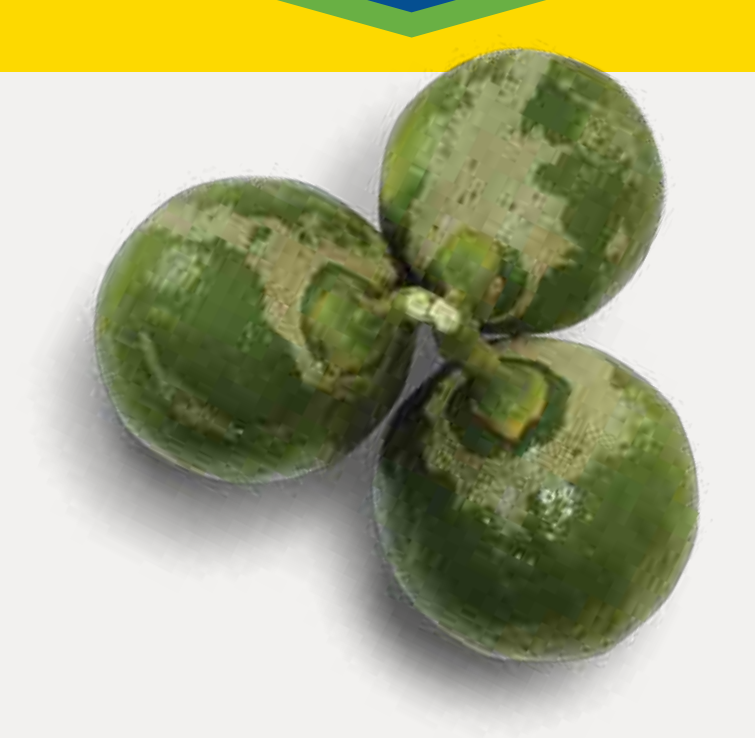
KCT damage on lemons (photo 1)