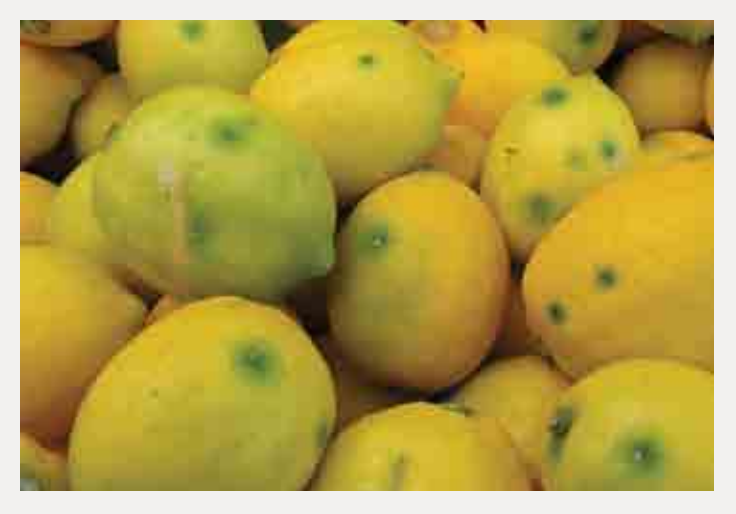
Scale infestation on Meyer Lemons (photo 2 - courtesy of Keith Pyle)